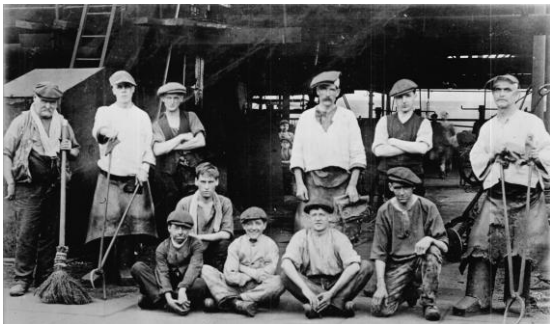
Above: One of the new pictures added to the original copy in this edition.